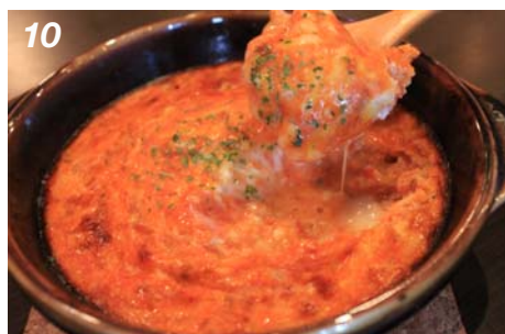
10 Italian omelettes piping hot melted cheese ¥780