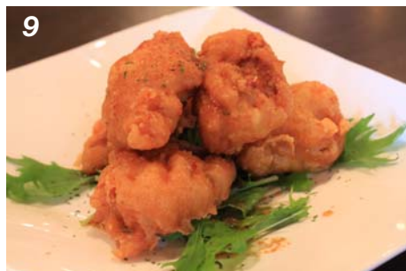
9 Dressing for Days's Kara-age~Magic is made with two types of sauce ¥680